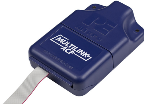
USB Multilink ACP Debug Probe