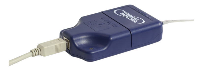
Figure 8-1: Multilink debug probe

PEmicro's Multilink and Multilink FX debug probes offer an affordable and compact solution for your development needs, and allows debugging and programming to be accomplished simply and efficiently. Those doing rapid development will find the Multilink and Multilink FX easy to use and fully capable of fast-paced debugging and programming.