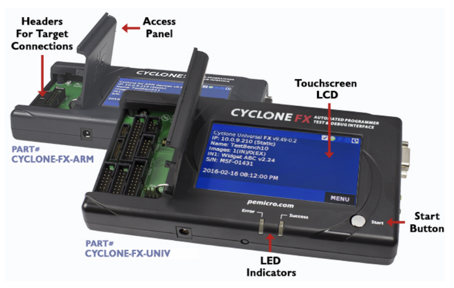
Figure 8-4: Cyclone FX Models