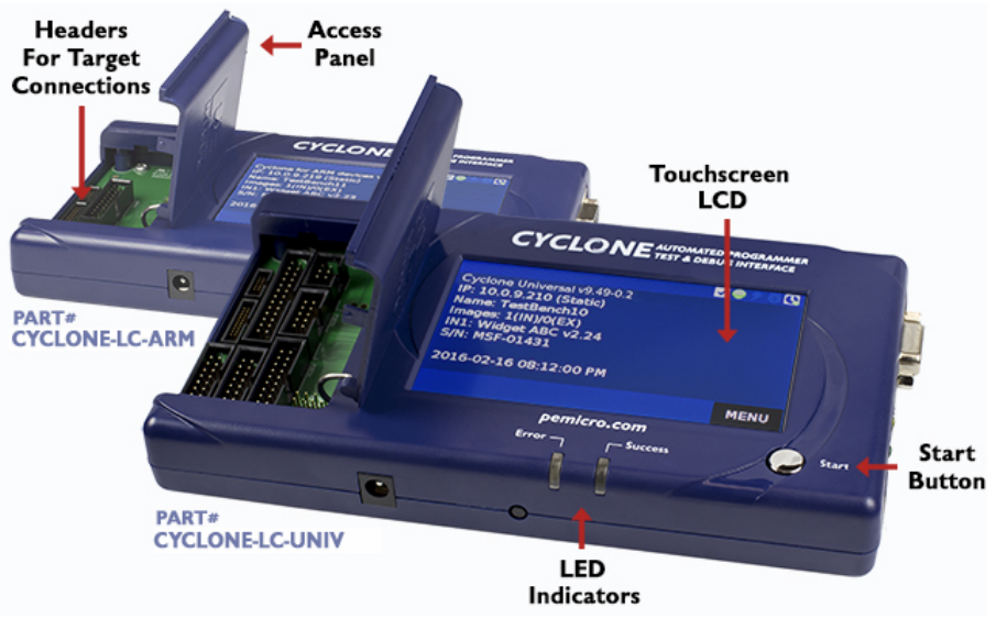
Figure 8-3: Cyclone LC Models