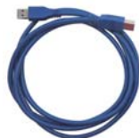
USB 3.0 cable